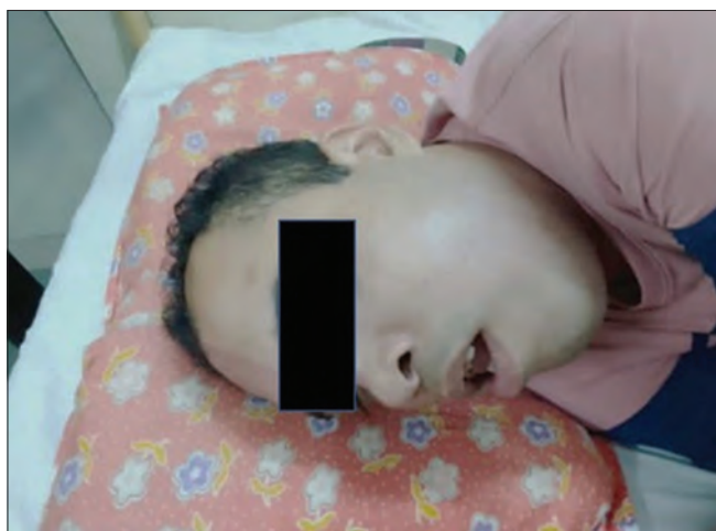
Figure 2: Photograph of the patient (case 2) of Sturge-Weber syndrome with Ludwig's angina.

Our study therefore showed that phenomenological understanding of these experiences could pave way for open-minded therapeutic interventions. It raises the possibility of investigating whether the use of means to abort such pre-ictal phenomenon will result ultimately in aborting the seizure itself. It also raises the possibility of investigating techniques like induction of sleep/narcosis by benzodiazepines or alternative therapies like fixing on an attention focus, yoga to be tested in such patients.[8]